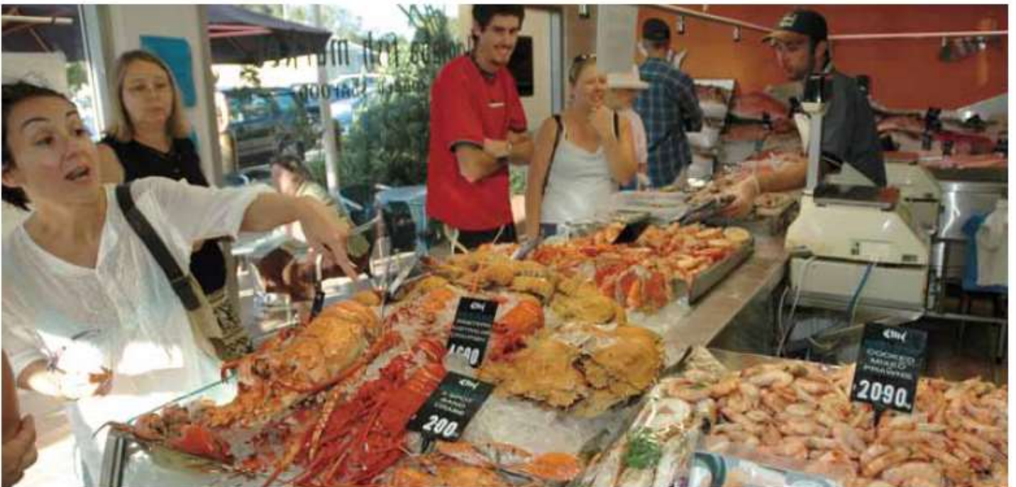
The great majority of Queensland's fisheries are well managed and sustainable, and are coping with consumer demand for a wide variety of fresh local seafood.

particularly when compared with the many inadequately managed threats from continued human population growth, including pollution in its many forms, ocean acidification, climate change and inappropriate coastal development. The impact of fishing on the environment is relatively well assessed, and it is slight: the impact of the changing environment on fisheries is not well assessed and is not effectively managed.