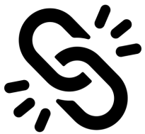
Supply Chain Disruption