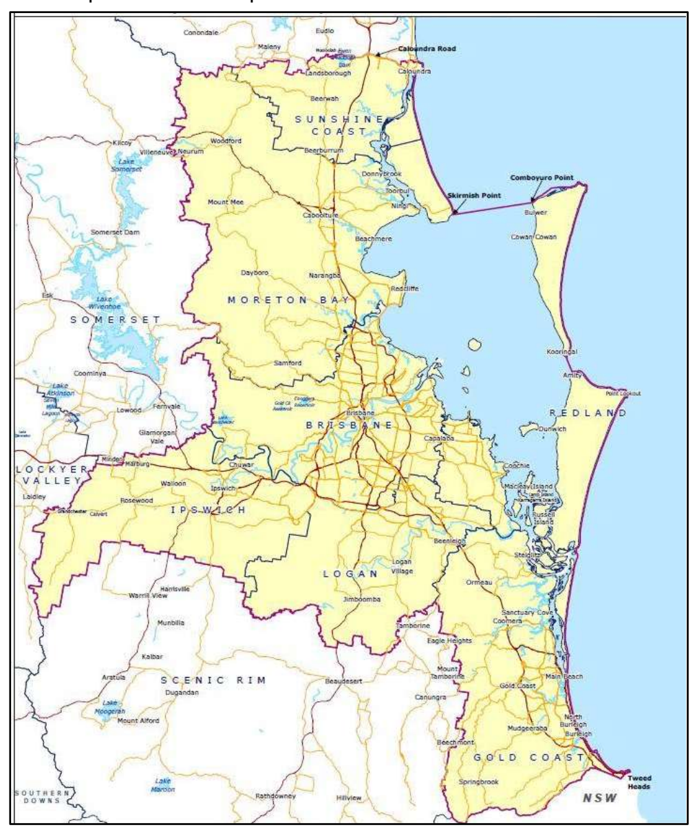
Figure 2 White Spot Disease Response: Movement Control Area

Since the first positive recording of the disease in early December 2016, the outbreak has had a direct financial and economic impact on prawn farms and wild fishers (prawn and crab fishers only) in the Logan River Region and southern Moreton Bay. The outbreak occurred at a time when farmers and fishers were nearing their 2016-17 seasonal productivity peak, with expectations to service the forthcoming summer's seafood demand at optimum prices.