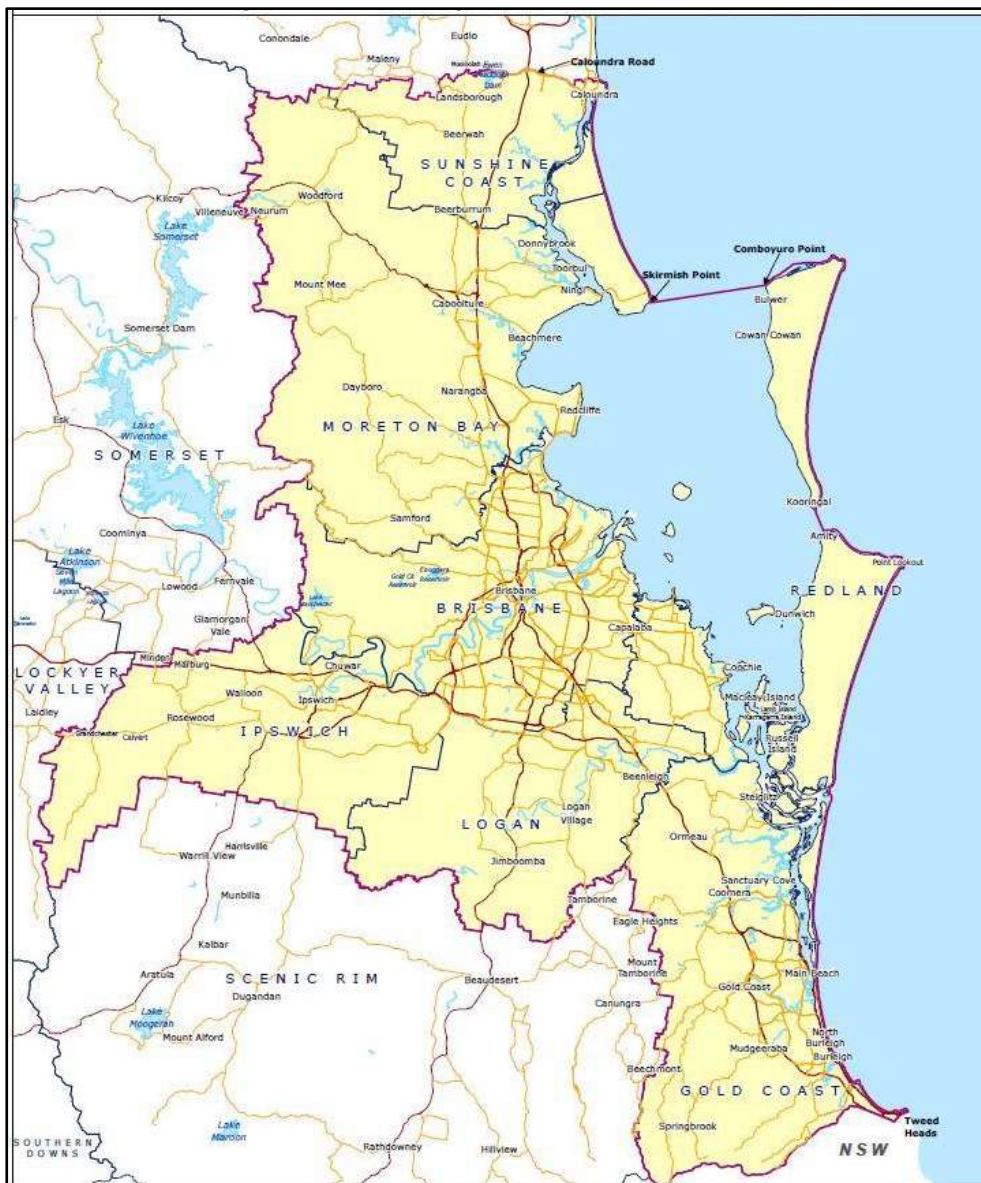
Figure 2 White Spot Disease Response: Movement Control Area

Since the first positive recording of the disease in early December 2016, the outbreak has had a direct financial and economic impact on prawn farms and wild fishers (prawn and crab fishers only) in the Logan River Region and southern Moreton Bay. The outbreak occurred at a time when farmers and fishers were nearing their 2016-17 seasonal productivity peak, with expectations to service the forthcoming summer's seafood demand at optimum prices.